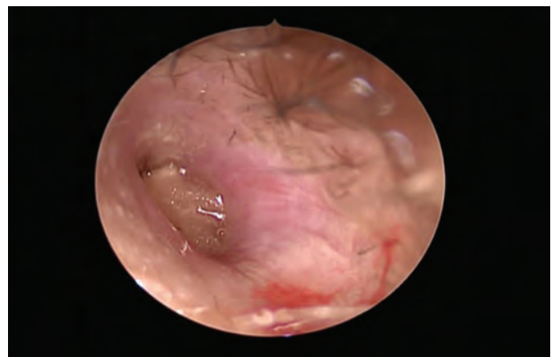
Fat graft injected with PRP covered by gelfoam soaked with PRP. PRP, platelet-rich plasma.

The patients were divided by a systemic random sampling method into two groups, with 20 patients in each group as follows: