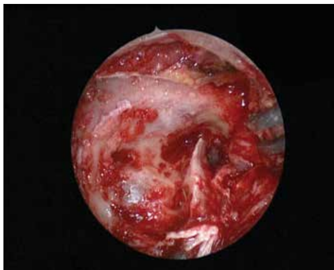
Figure 1. The upper one-third of the posterior canal wall together with the attic (epitympanum) is drilled out leaving the remaining lower two-thirds intact.

Primary ossicular reconstruction is performed for all patients using partial ossicular replacement prosthesis (PORP) or total ossicular replace-