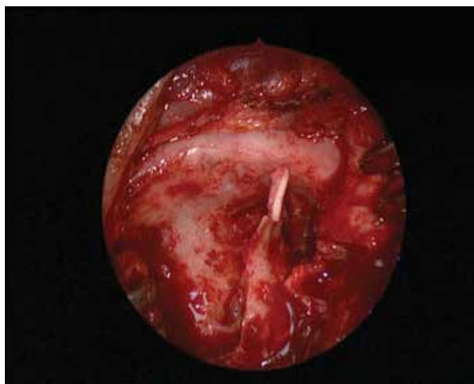
Figure 2. Conchal cartilage in place over the intact lower two-thirds before placement of temporalis fascia.

ment prosthesis (TORP) depending on the presence or absence of stapes suprastructures. It is performed even if second-look surgery is planned. The prosthesis helps maintain the middle ear space and support the reconstructed wall cartilage. The superficial layer of the temporalis fascia is used to provide a soft tissue cover over the conchal cartilage, while the deep temporalis fascia is used to reconstruct the tympanic membrane (Figure 3). Gelfoam soaked with antibiotics and steroids is inserted medially and laterally to the new tympanic membrane.